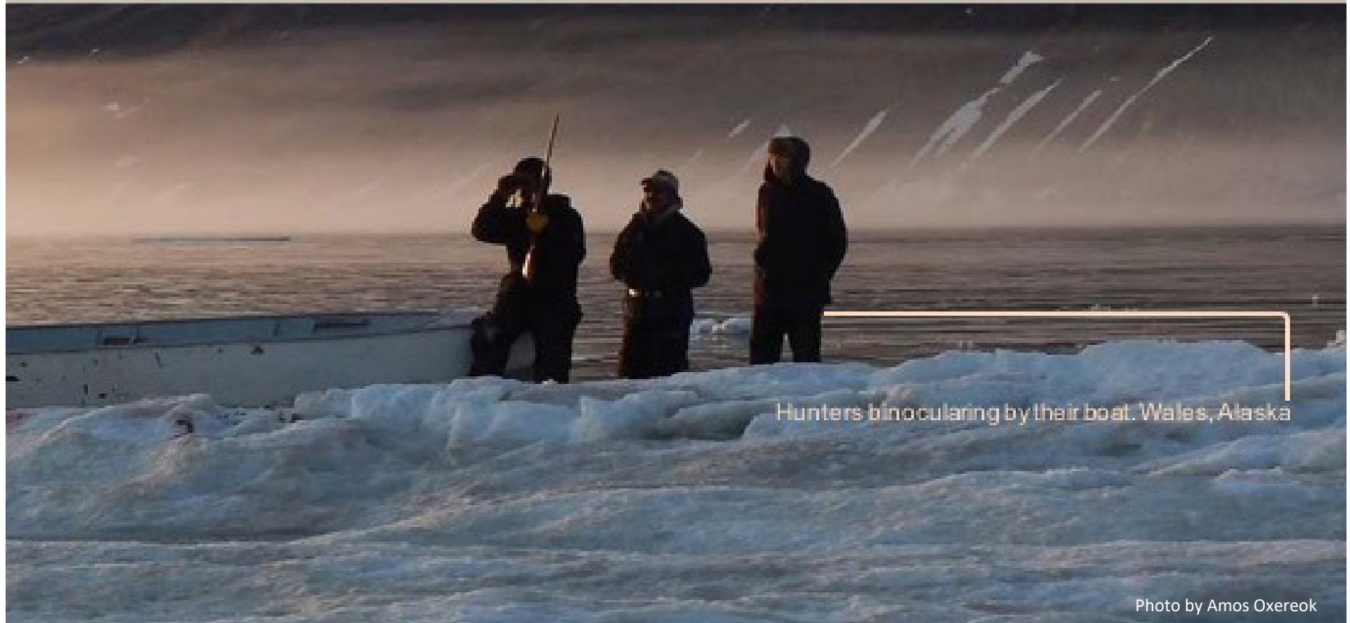
Hunters binocularing by their boat. Wales, Alaska

Next Steps: We are now exploring the development of a Circumpolar Inuit Wildlife Committee that will focus on addressing the challenges shared in this presentation