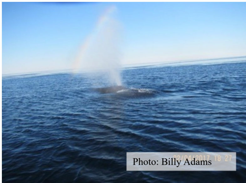
22/04/2017 18:27