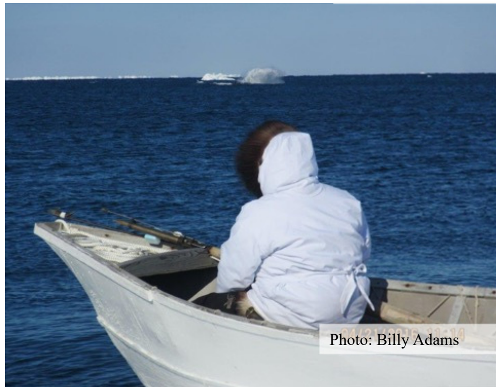
22/04/2017 19:14